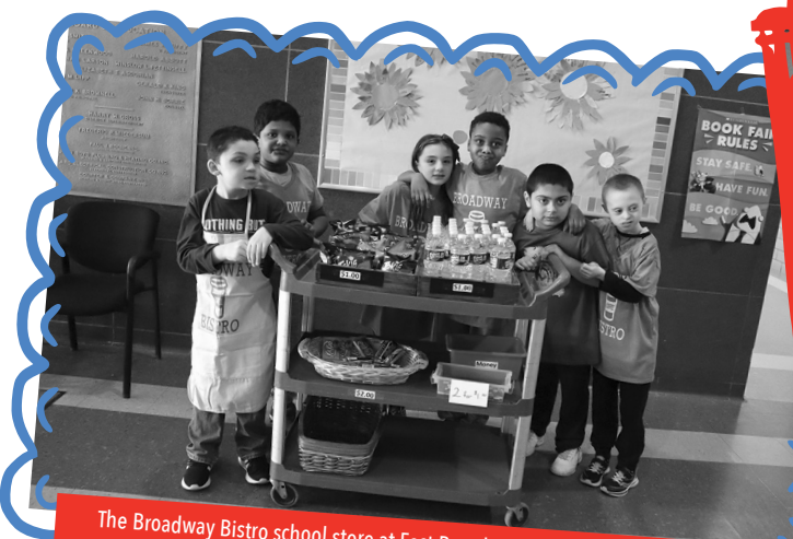
The Broadway Bistro school store at East Broadway Elementary School has proven to be an excellent educational resource for students in the ABA program.