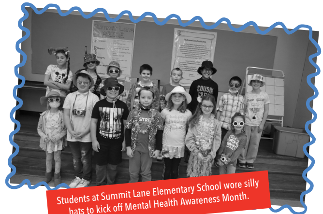
Students at Summit Lane Elementary School wore silly hats to kick off Mental Health Awareness Month.