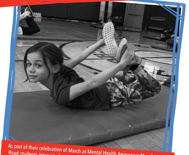
As part of their celebration of March as Mental Health Awareness Month, Lee Road students integrated yoga into their routines. Students worked on their balance, strength and flexibility while improving their focus and concentration.