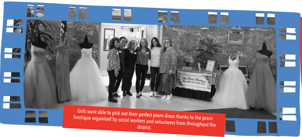
Girls were able to pick out their perfect prom dress thanks to the prom boutique organized by social workers and volunteers from throughout the district.