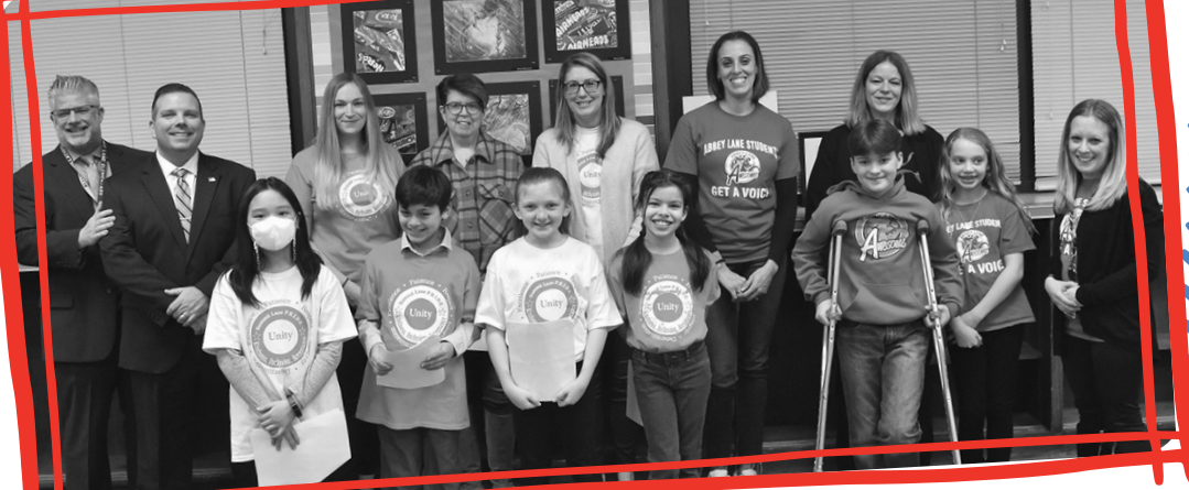
Students from Abbey Lane and Summit Lane elementary schools highlighted their character education programs in which they learned how to combat bullying and create positive learning environments.