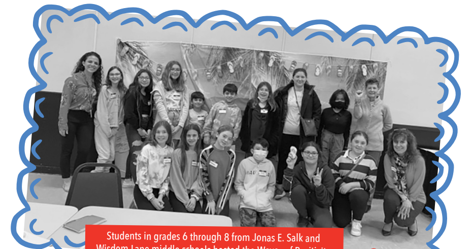
Students in grades 6 through 8 from Jonas E. Salk and Wisdom Lane middle schools hosted the Waves of Positivity event, aimed at promoting mental well-being and healthy habits.

In each school, social workers assist students with their daily struggles as well, acting as an always-available resource to the school community. There is always a space in Levittown schools for students to express themselves and overcome any hurdle.