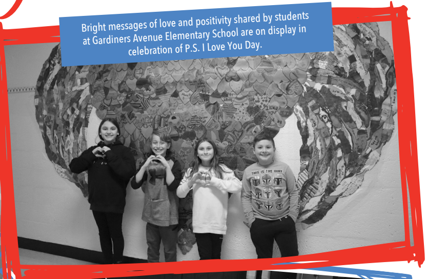
Bright messages of love and positivity shared by students at Gardiners Avenue Elementary School are on display in celebration of P.S. I Love You Day.